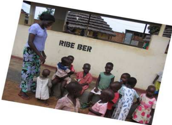
Nursery Teacher and Kids

The smaller babies remain with their mothers in the class as they are still nursing. They sing songs, dance and are involved in organized play. The kids own space was recently set up so the kids can learn and play in a safe environment.