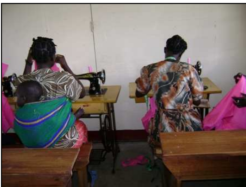
Girls in a sewing class