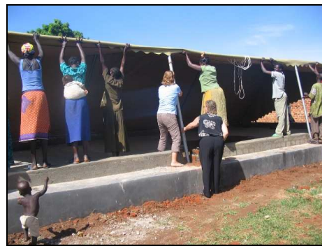
The New Nursery tent to shade the children from the sun and rain

The smaller babies remain with their mothers in the class as they are still nursing. They sing songs, dance and are involved in organized play. The kids own space was recently set up so the kids can learn and play in a safe environment.