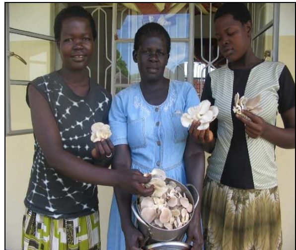
Some of the girls with their teacher displaying Mushrooms grown at the Centre

had several harvests and enjoyed a mushroom meal!